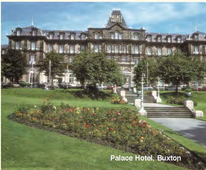
Palace Hotel, Buxton

Also the Devonshire Royal Hospital with its 138ft span dome - one of the widest in the world. A truly veritable feast of attractions making Buxton one of the country's most popular towns to visit and explore. We spend four days exploring the delights of Derbyshire and the Peak District. We take in the very best scenery and attractions the region has to offer so you are in for a real treat.