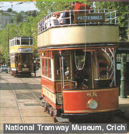
National Tramway Museum, Crich