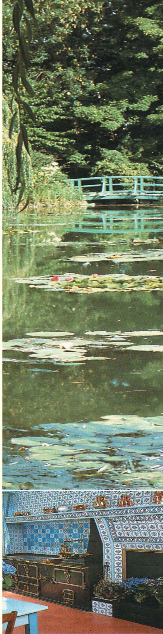
Claude Monet's Gardens and House at Giverny

The Trading Name of Dalkeith Enterprises Ltd.