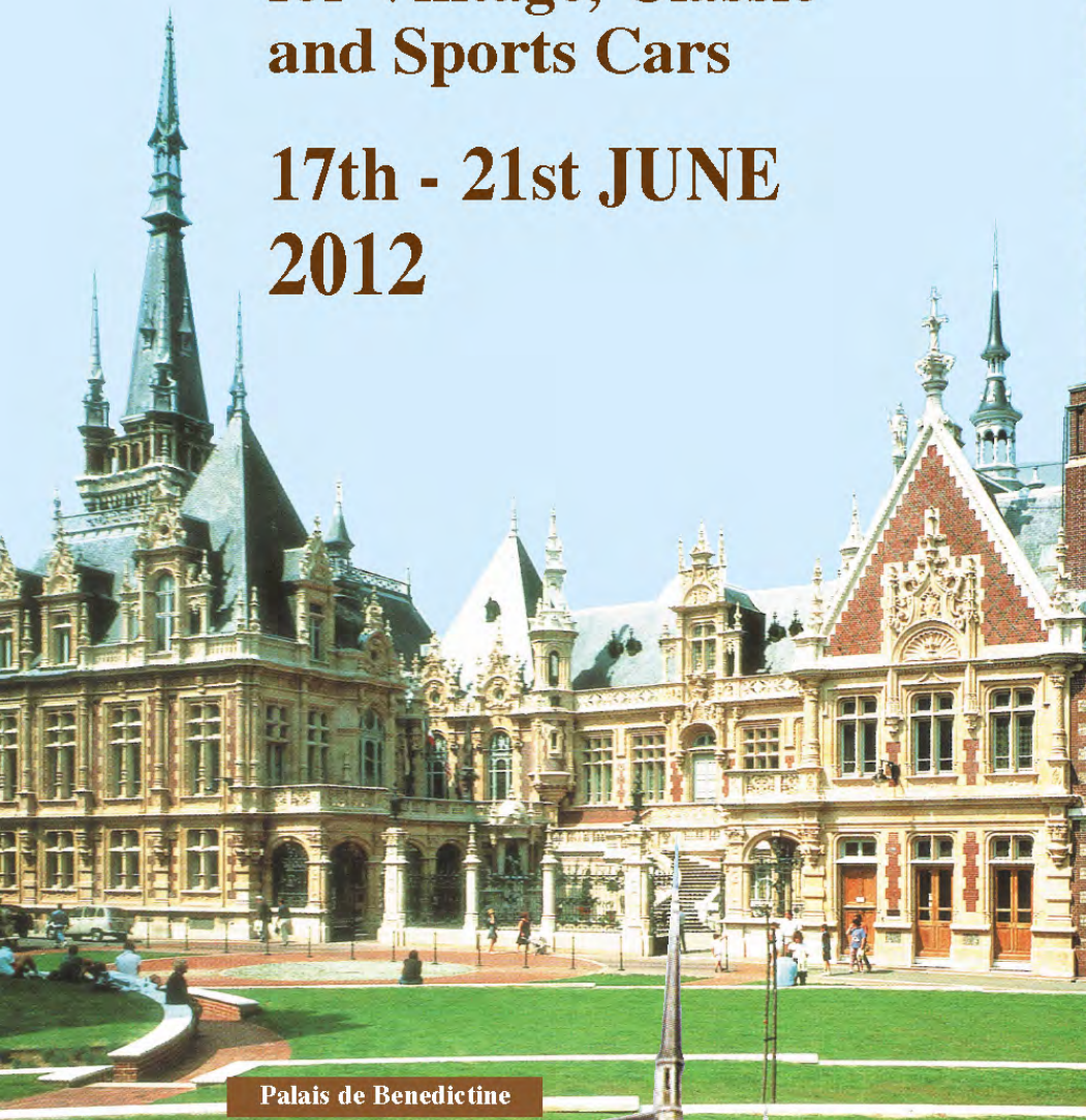
Palais de Benedictine