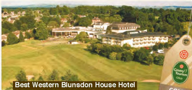
Best Western Blunsdon House Hotel

The hotel features 116 rooms, indoor swimming pool and leisure centre, three bars and two restaurants and thirty acres of grounds and gardens to stroll around.