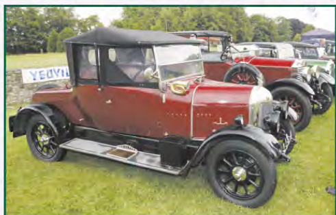
Above : Vintage beauties