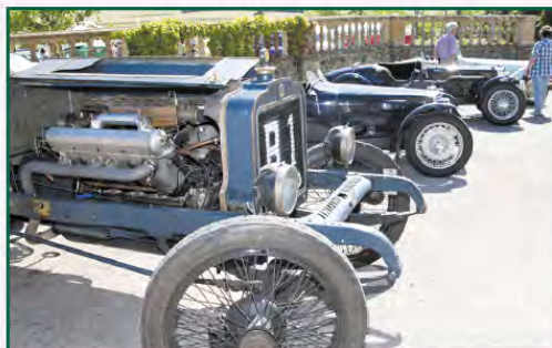
Above : 1908 Brasier fronts line-up of vintage racers